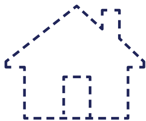
FIGURE 1: OUTCOMES FOR YOUTH WHO AGE OUT OF CARE

Despite these trends, several studies have shown that older youth in care who are connected to a supportive adult experience better well-being, stronger protective factors, and engage in fewer risk-taking behaviors. 7 A recent study also found improved educational outcomes and financial self-sufficiency in a sample of former foster youth who had supportive connections with both birth parents and parent-like figures. Conversely, former youth in care with fewer connections to non-relative supportive adults had more negative outcomes. 8